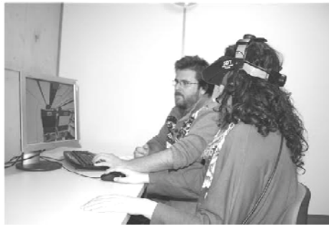
Virtual reality exposure treatment assisted by a therapist (VRET)