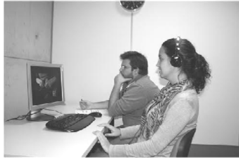
Computer-aided exposure with a therapist (CAE-T)