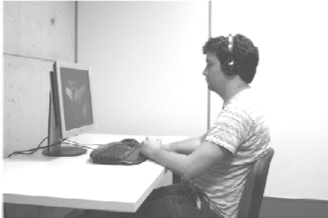
Self-administered computer-aided exposure (CAE-SA)